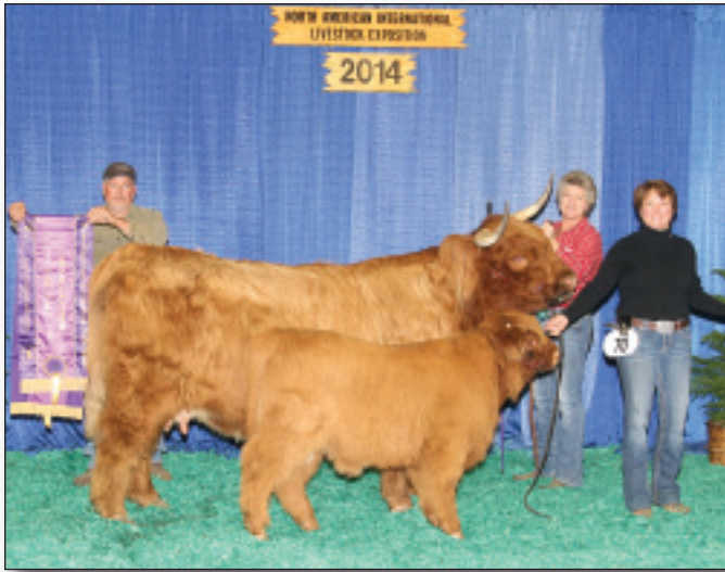
Dam of Lot 25