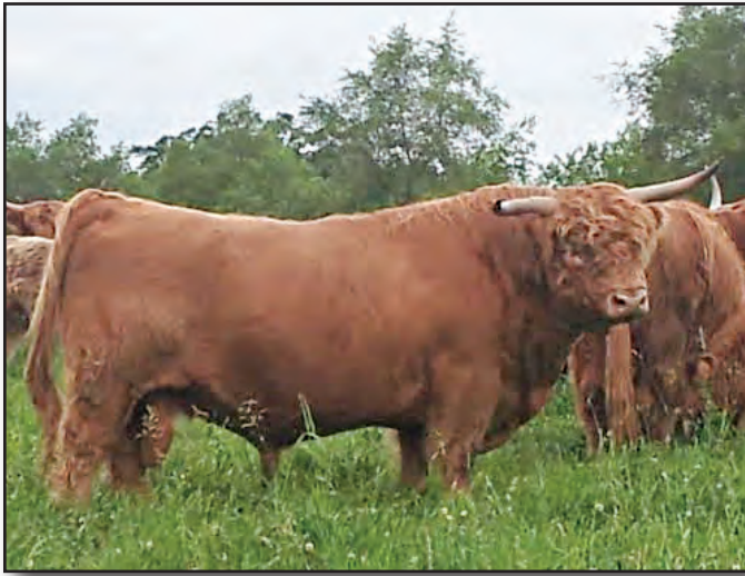
Sire of Lot 13