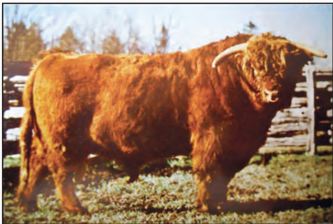
Sire of Lot 25

Five straws will be sold in one lot; fair market value is $30/straw. Purchase price in excess of FMV is tax deductible as permitted by law. Buyer pays shipping and must take possession within 60 days of purchase. Transaction between buyer and seller only; AHCA Rules & Regulations apply. Eligible for USA only. All proceeds to benefit the Highland Cattle Foundation.