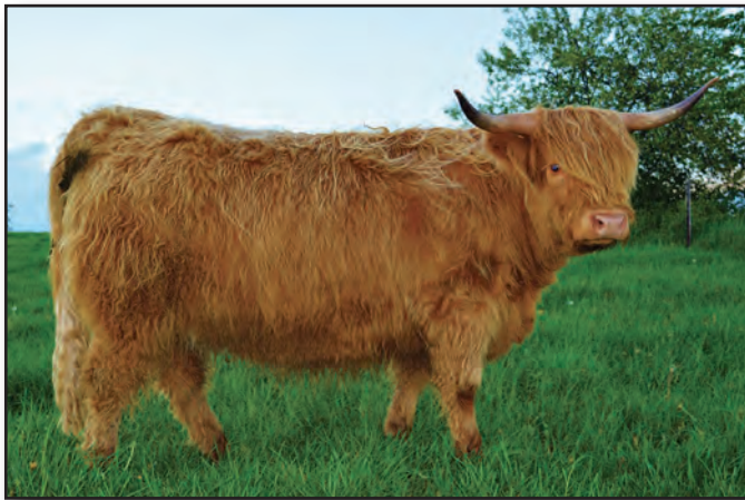
Dam of Lot 11

Brown's Peak Frankie is a very nicely proportioned light red heifer. Her dam, LEA Muireall, a yellow cow purchased at the 2019 NWSS, is a broad deep-bodied cow with excellent spring of rib and a quality udder. Her dam, LEA Gloriosa, is an Impact Dam who has had a calf every year for the past nine years. Frankie's adjusted weaning weight was 458 lbs. without creep feeding. She is in the first crop of the promising three-year-old bull, CSF Roosevelt, a smooth-sided, well-mannered Scottish looking bull in the GOF Ralph line. For more information on Frankie, visit climbingstumpfarm.com .