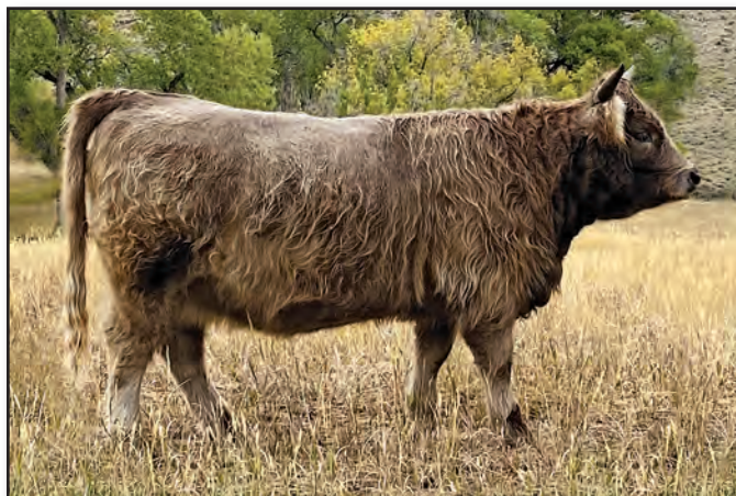
Dam of Lot 26

Dually registered in the US and Canada, Lapland originated from performance oriented Glen Osprey Farm. They imported his sire and dam directly from the UK in the mid 1970s. This bull, like many GOF cattle, was larger framed with great carcass qualities. He shared good feet and legs and a delightful temperament with his herd mates. The pedigree is stacked 100% Scottish and traces back to renowned folds including Achnacloich, Leys, Scone Palace, Strathallan and Douneside.