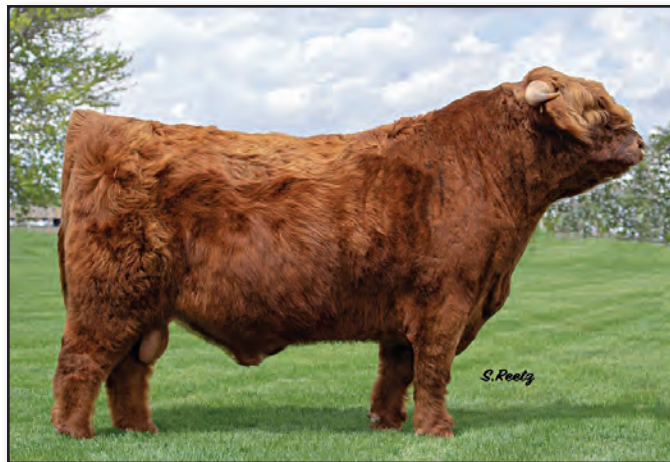
Sire of Lot 15

Lilac is a stunning silver heifer. A beauty who's striking appearance is balanced with a sweet-natured demeanor. She is extremely easy to get along with. Lilac's great depth of rib, width of hip and solid stride set her up to be a tremendous cow prospect. Her pedigree boasts Finley Falls Duncan, the infamous, undefeated 2-year Champion as well as multiple dun, white and silver extended pedigree genetics. Lilac completed her first show as a division winner.